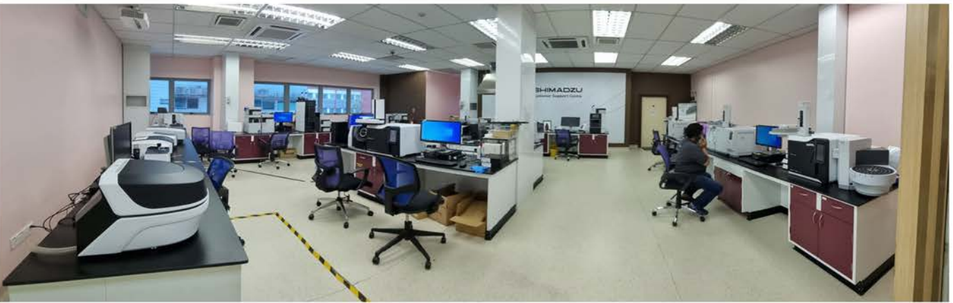
CSC Analytical Laboratory